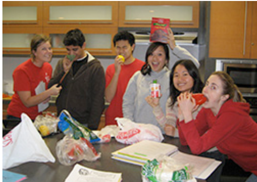
UC San Diego Student Health Advocates pose before teaching a healthy cooking class.

However, UC San Diego's five full-scale dining facilities offer many choices for healthy nutrition. "Students also can make requests to have their favorite healthy foods or healthy recipes from home to be included in the dining facilities menu rotation," she said. "They can consult with me, a registered dietitian, for no cost. I regularly meet with students to guide them towards healthful eating habits on campus."