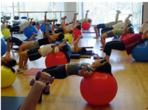
Students work out on campus at the wellness / fitness facilities.