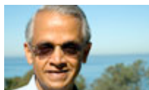
Scripps Climate Science Pioneer Awarded Tyler Prize

Women Speak Out in Reversing the Lens Exhibit at UC San Diego